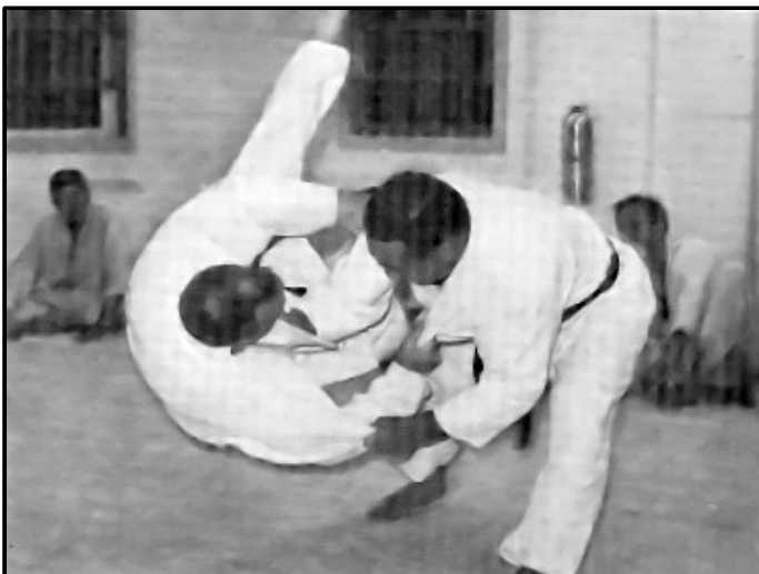
THE FINAL MOMENT of tai-otoshi by Isao Inokuma.